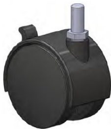
QTY 4: Threaded Stud Casters