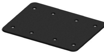
QTY 2: Ganging Plates